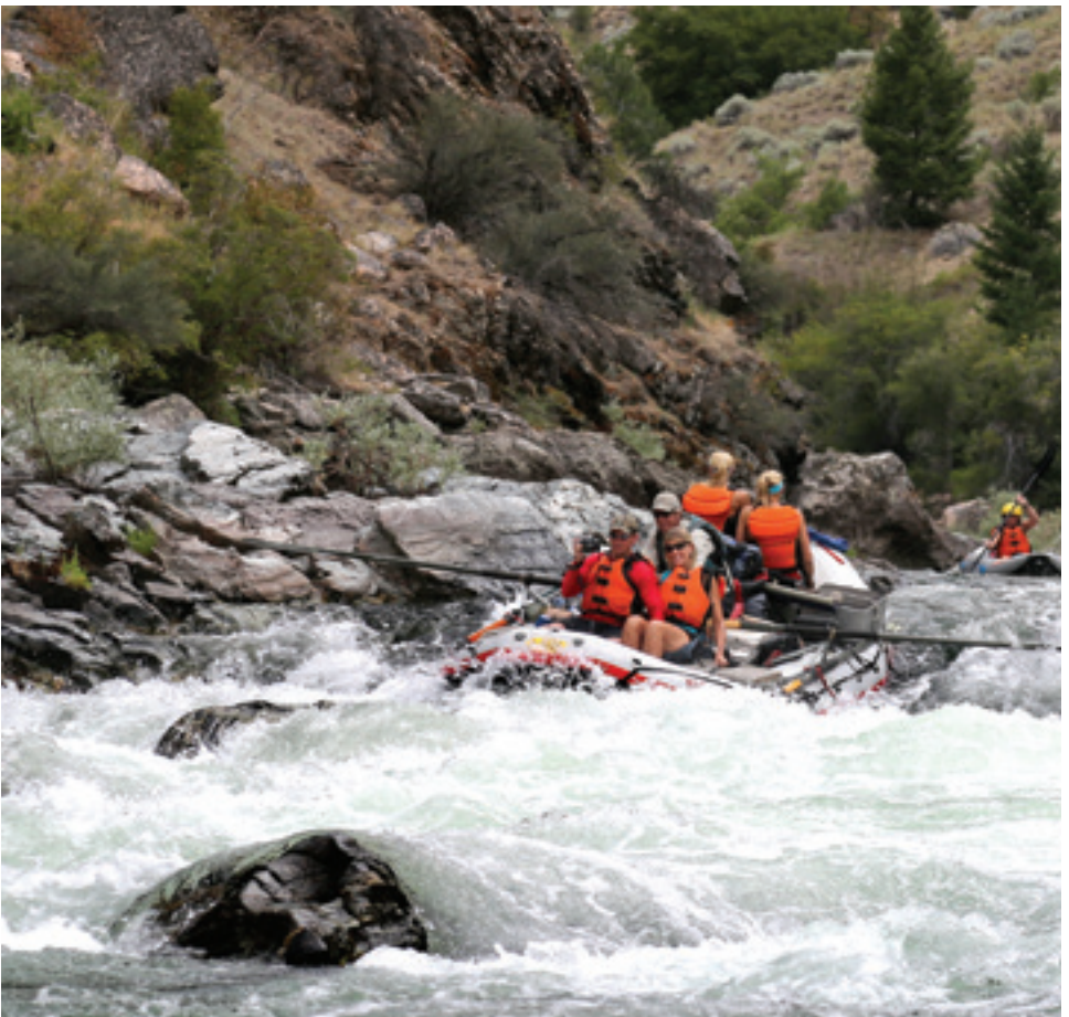
Middle Fork of the Salmon