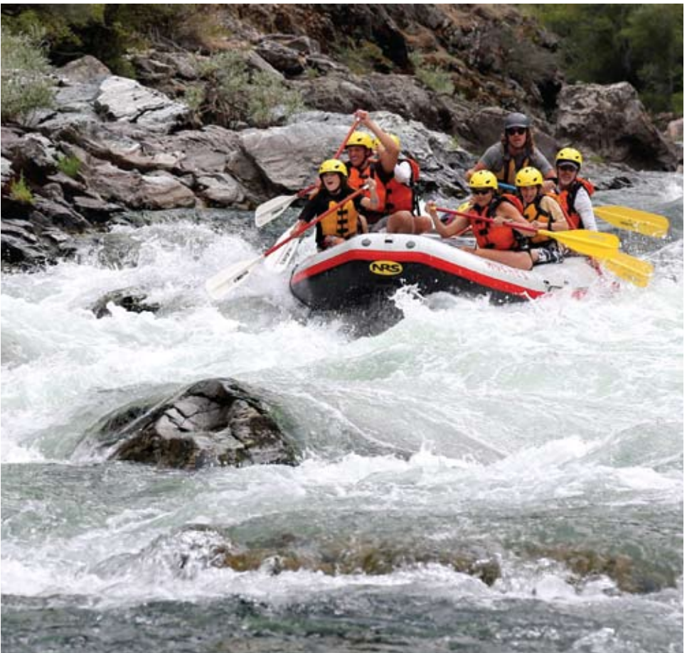
Middle Fork of the Salmon