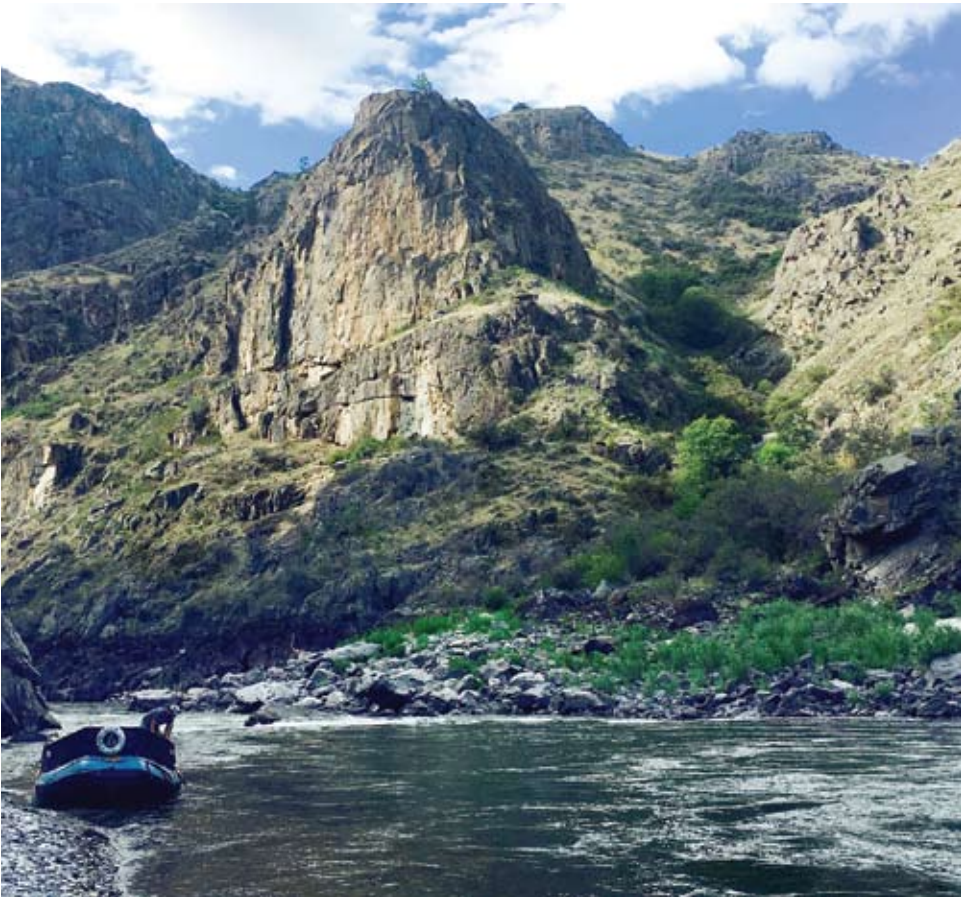
Salmon River Canyons